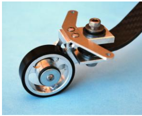
WRE 2.5 ounces

There appear to be three tail wheels on the market that are made with good ground handling and longevity in mind. These two attributes make them about twice as expensive as the rest of the offerings. One of them is made by White Rose Engineering and will be referred to as WRE, the second will be called Product #1 or P1 and the third will be referred to as Clone of Product #1 or CP1 because that best describes it. All three are pictured below.