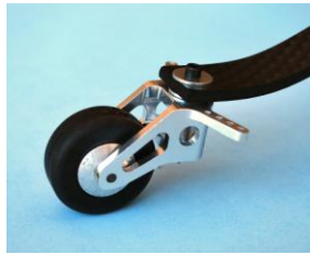
P1 3.1 ounces