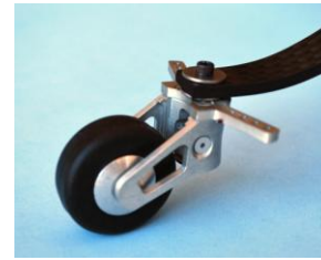
CP1 3.2 ounces

As previously stated all three of these are good products but the WRL product costs around ten bucks more, why is this? Here is what differentiates the WRL product from the other two;